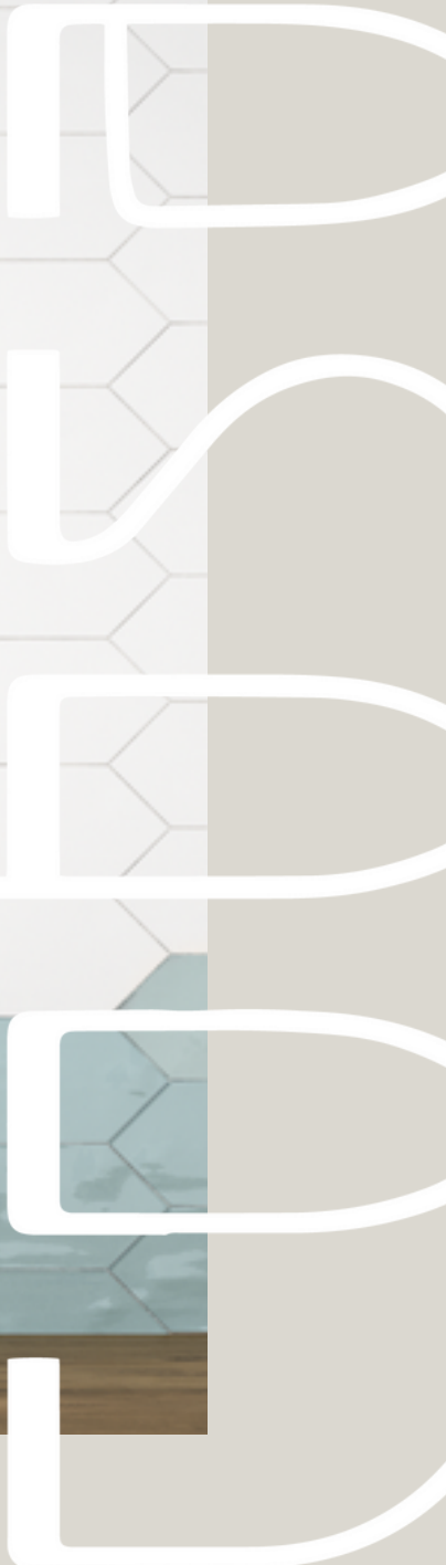
Taylor, WHITE + SKY